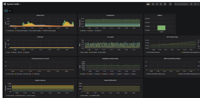
Telemetry data visualized by Grafana

Both SD-TV and HD-TV streams can be monitored.